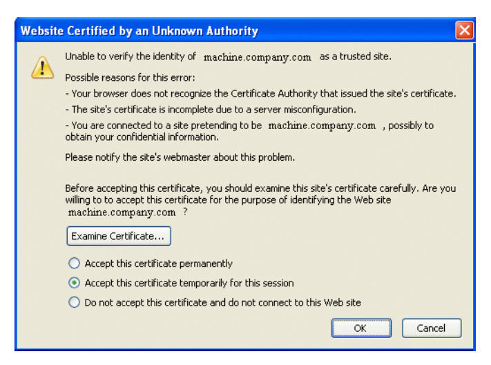
Figure 5–1 Sample Browser Response to Untrusted Certificate

Similarly, the first time asadmin receives an untrusted certificate, it displays the certificate and lets you accept it or reject it, as follows: (If you accept it, asadmin also accepts that certificate in the future.)