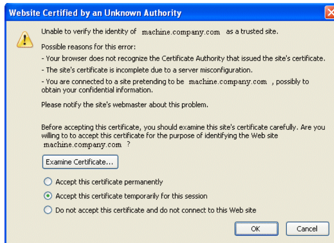
Figure 5-1 Sample Browser Response to Untrusted Certificate

Similarly, the first time asadmin receives an untrusted certificate, it displays the certificate and lets you accept it or reject it, as follows: (If you accept it, asadmin also accepts that certificate in the future.)